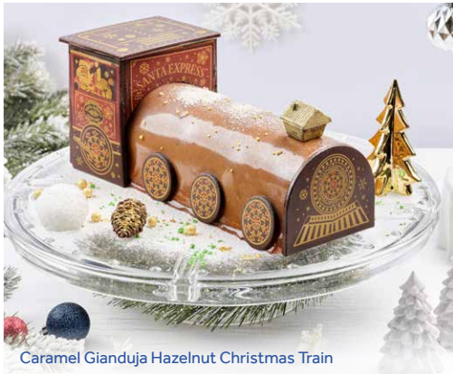
Caramel Gianduja Hazelnut Christmas Train