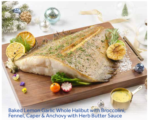
Baked Lemon Garlic Whole Halibut with Broccolini, Fennel, Capers & Anchovy with Herb Butter Sauce