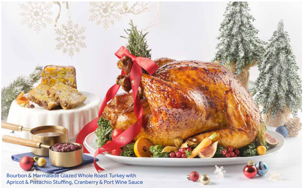
Bourbon & Marmalade Glazed Whole Roast Turkey with Apricot & Pistachio Stuffing, Cranberry & Port Wine Sauce