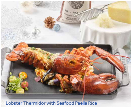
Lobster Thermidor with Seafood Paella Rice