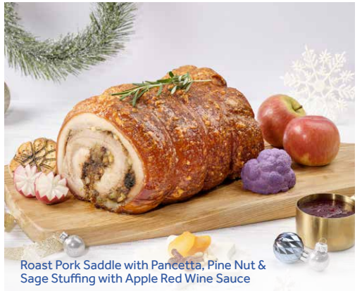
Roast Pork Saddle with Pancetta, Pine Nut & Sage Stuffing with Apple Red Wine Sauce